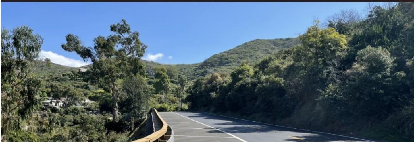
Bluebird Canyon Drive Evacuation Route Widening | Laguna Beach, California